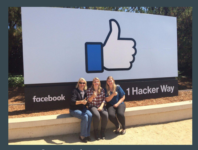
Some typical tourists... some even try and sneak into the office